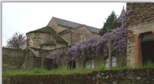
Live in history with modern conveniences – private showers; fully functional kitchen and dining areas; onsite laundry facility; internet access.